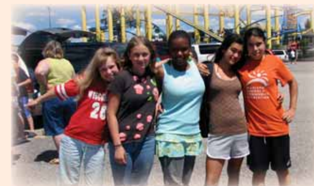
Friendship is a big part of Wander Wisconsin trips.

Unique adventures and camping experiences for youth.