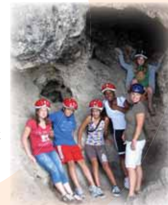
Wander trips give youth a chance to try new things.