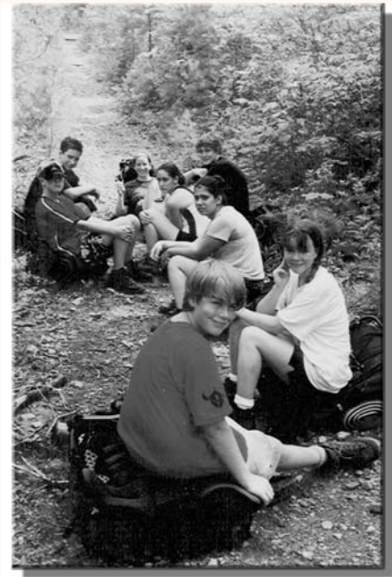
Resting on the Trail

The memories that will stick with me are the ones I can't list off as events. I will remember the moments when we laughed until it hurt and when we sang in loud and silly voices.