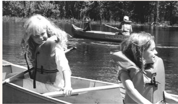
Canoeing Madison's Lakes

Explorers (10-12 year olds) will enjoy Peninsula State Park and the wonders of Door County the week of June 23. The week of July 28 is a great introduction to canoeing for our Explorers group right here on the Madison area lakes. The week of August 11 is a very new and unique